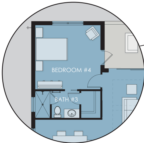
OPTIONAL ENSUITE FOURTH BEDROOM

3 BEDROOMS | 2.5 BATHS | BONUS ROOM | 3-CAR GARAGE